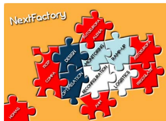
Fig. 3. VFF scenarios [1]

The need of verifying the impact of the VFF approach on the Real Factory asks for the cooperation of industrial partners to define demonstration scenarios that aim at testing and validating the proposed framework. Within the project, four demonstration scenarios (Figure 3) have been formulated by pairing different factory planning processes and industrial sectors.