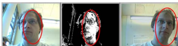
Figure 4: Head tracking software (client)