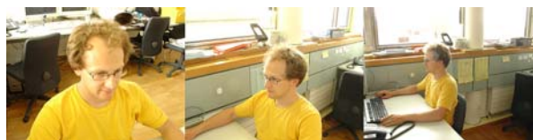
Figure 1: Different points of view of the camera

We present MatrixView (MV) – a setup to increase immersion in video conferencing systems. MV consists of a pan-tilt video camera mounted on a car which moves along a horizontal track. The car moves in such a way, that the user is kept in the center of the image (“Matrix” movie effect, see Figure 1). Using this setup in a video conference application, enables a remote user to manipulate his virtual position and orientation relatively to the acquired object or person. We use computer vision to track the remote observer’s head and adjust the camera position according to the head movements. Alternatively the camera can be remote-controlled by using a GUI. Preliminary tests have given us a positive user feedback.