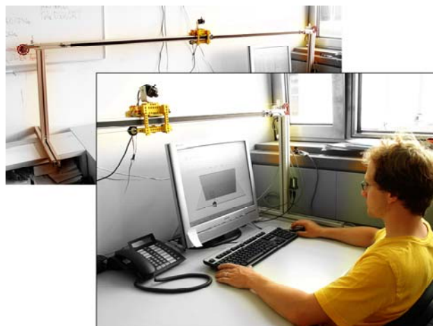
Figure 2: MatrixView: Pan, tilt camera on a rail acquiring a user from different view points

Several tools have been developed to overcome this lack of presence. Gaver et al. [1] have presented a system similar to MV, which used a very limited vertical and horizontal sliding mechanics (30 x 30cm) to move the camera and set focal points. Our system extends the interaction space to the width of 2m to create a significant change in perspective. Paulos and Canny presented Prop [2], small robots that could be remote-controlled via internet (Tele embodiments). The robots were each equipped with a camera, a display, and a remote controllable gripper. The robots were suitable to be used in open areas with few obstacles. An other system that combines a panoramic and a pan-tilt-zoom camera to create a more intuitive interaction have been tested by Liu et al. [3]. The system was designed for large conference rooms and one point of view while our system is able to additionally change the point of view for an observer.