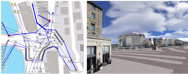
Figure 2. Left: Sankey diagram using Plant Simulation software [9] to verify the modeled behavior, Right: 3D model.

The main focus of the simulation model was laid on the detailed reproduction of the traffic behavior. The model allows the policemen to make decisions which road gets the right of way and how many cars can pass. The public transportation on the other hand is modeled within an automatic reaction system with waiting queues. Each time the user changes the right of way, this reaction system is triggered and handles the control of waiting trams and busses with the possibility to cross the intersection based on the given right of way. After an extensive data acquisition, the model was verified within longtime simulations, and the basic behavior and distribution of traffic amounts were analyzed using the Sankey diagram function (see Figure 2, left).